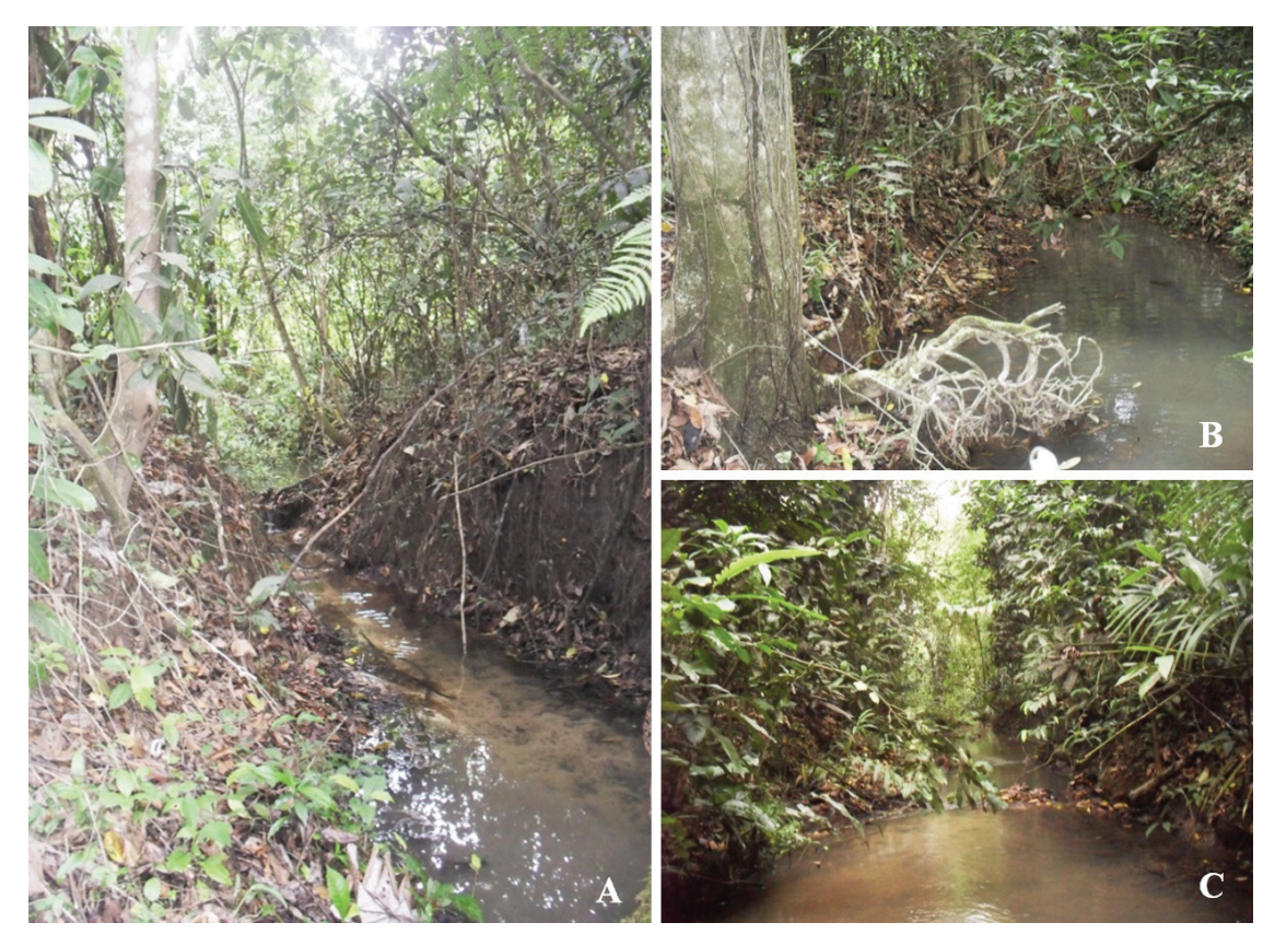
Figure 1. Images of the three blocks A, B and C, respectively, sampled during rainy season in May, 2013 at the stream Saltinho of the Biological Reserve of Saltinho, Tamandare city – Pernambuco, Brazil.